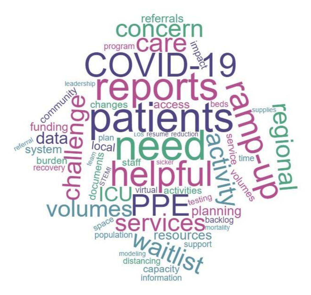
Figure 1. Word Cloud Key Words: Q4 19/20 Discussions

To summarize the discussions at a high level, key phrases and meeting notes were compiled and added to a word cloud generator. A word cloud is a visual representation of text data, used to depict key words used during discussions or free form text. The importance of each key word is shown by size – the bigger the word, the more times it was repeated during all the discussions.