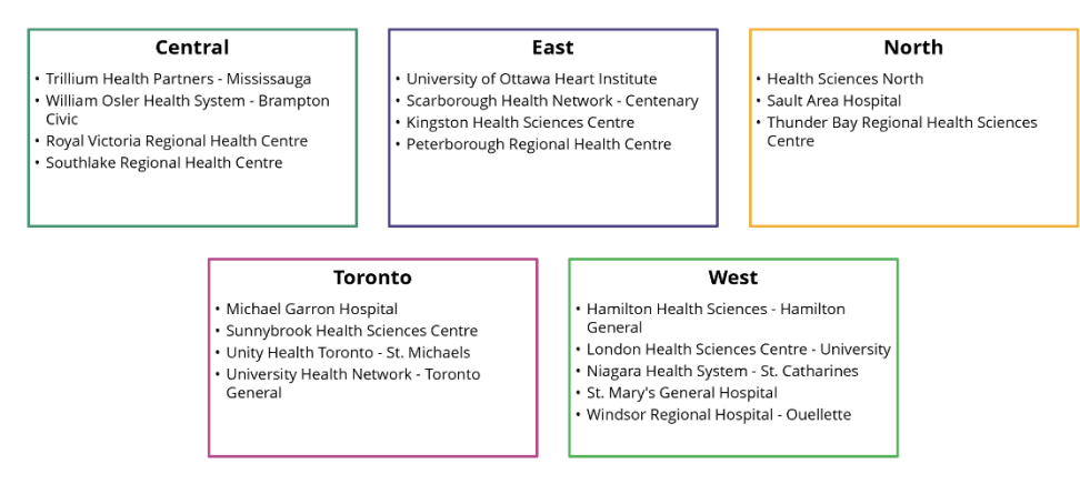
Figure 2: Ontario Interim Regions and Cardiac Programs

Discussions have been summarized within the five regions to better support regional interpretation of provincial themes in Figure 3 . regions are aligned with the current Ontario Interim Regions; see Figure 2 for a list of Cardiac Programs within each region.