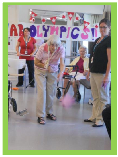
Bean Bag Toss participant